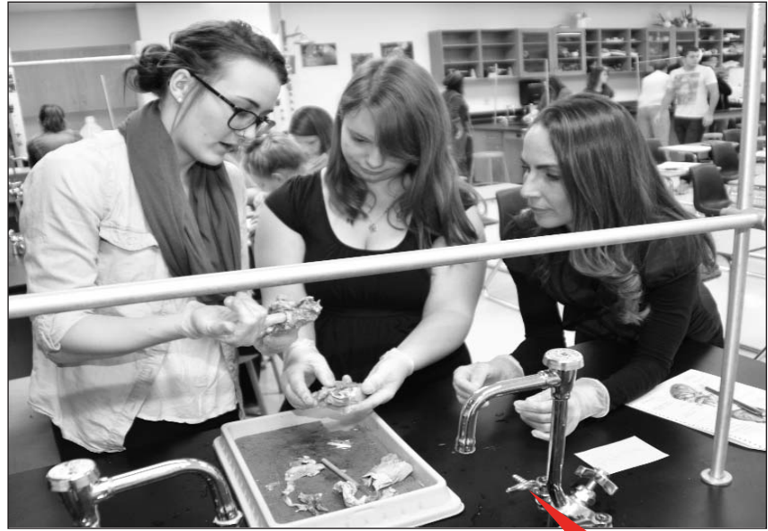
The latest science laboratories