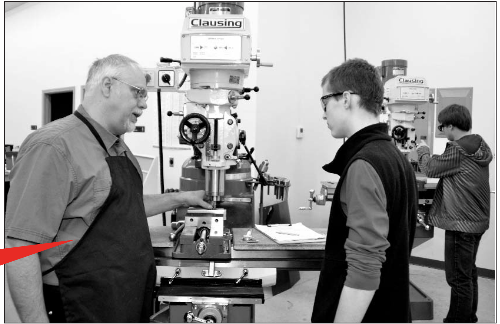
State of the art machining curriculum

All high school students are encouraged to participate in a variety of co-curricular activities such as drama and debate, FFA and football, Youth Leadership Team and yearbook, and peer tutoring and photography.