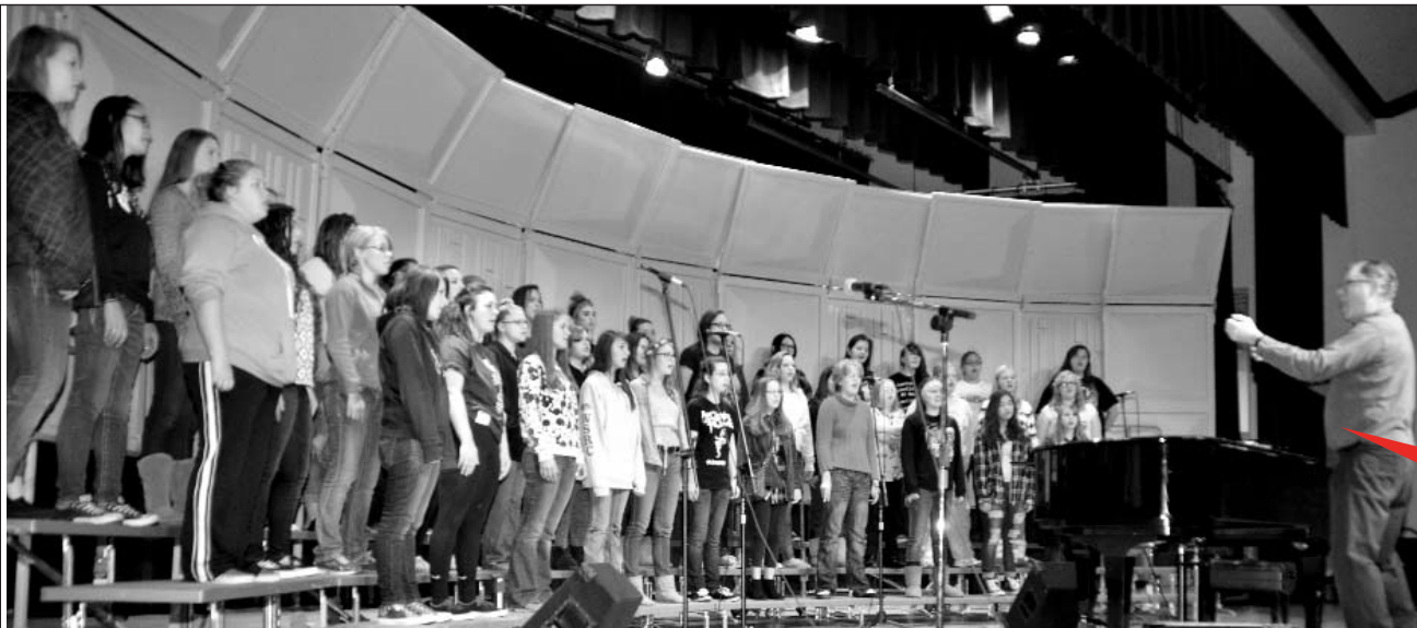
Outstanding music programs