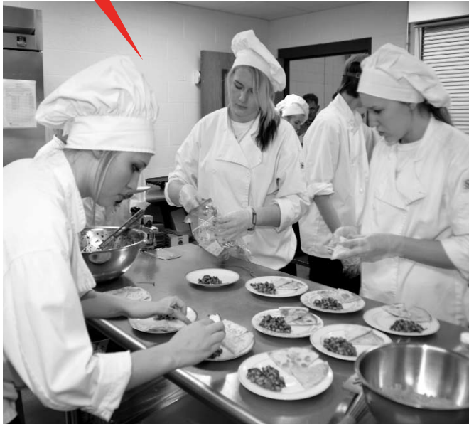
Contest-winning culinary arts course