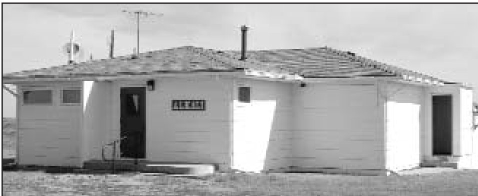
The Alkali School was built in 1964 and is located approximately 25 miles southeast of Sturgis.

Alkali School is officially closed as a result of action taken by the school board during its December meeting. The rural school had been in suspended operations since the 2010-11 school year due to low enrollment and budgetary and staffing constraints at the time.