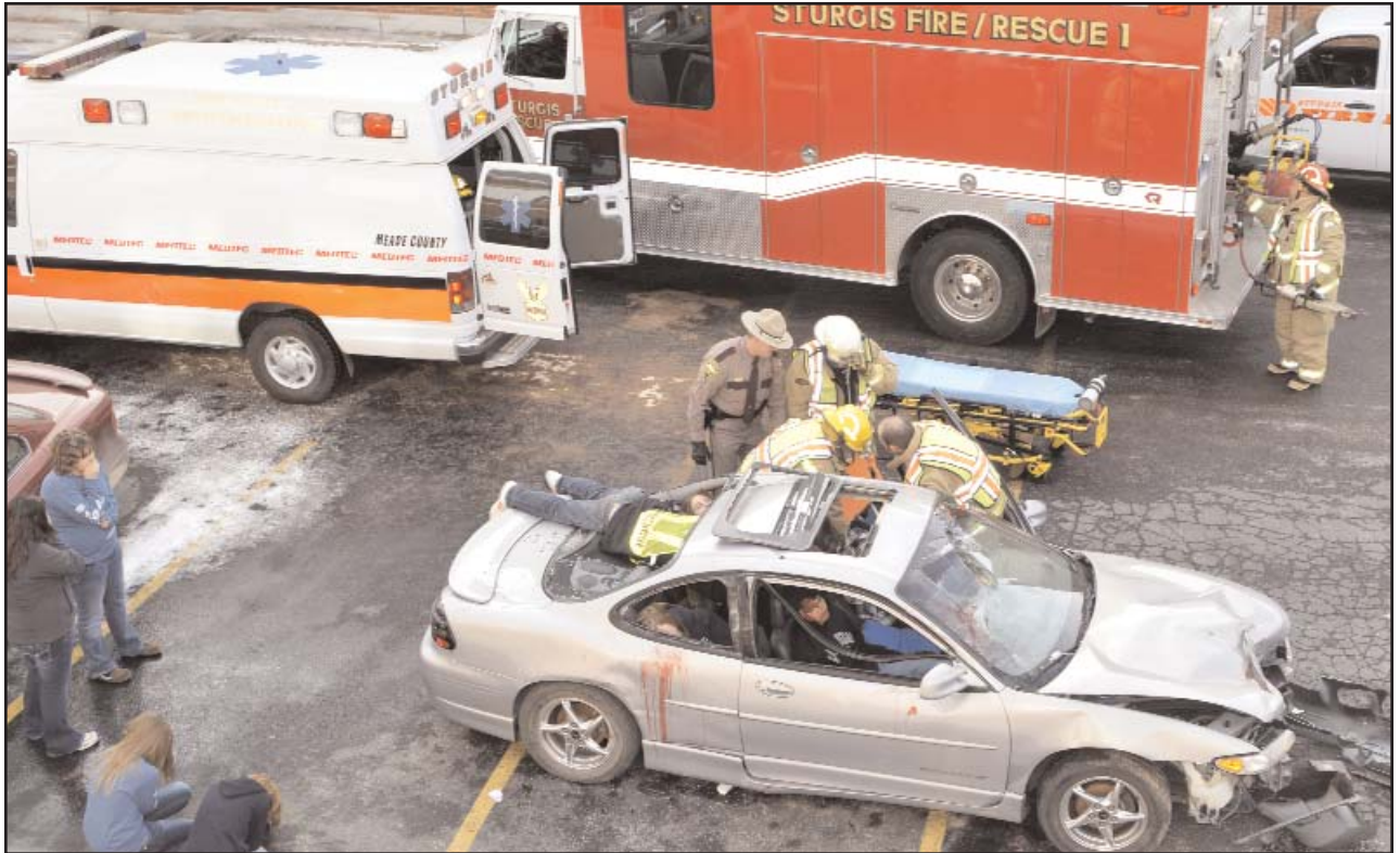
Two of the four students in the mock car crash died. After observing the medical, fire and law enforcement responses to the accident, the eighth-graders visited the mock emergency room/intensive care unit where they learned about possible injuries and treatment options.